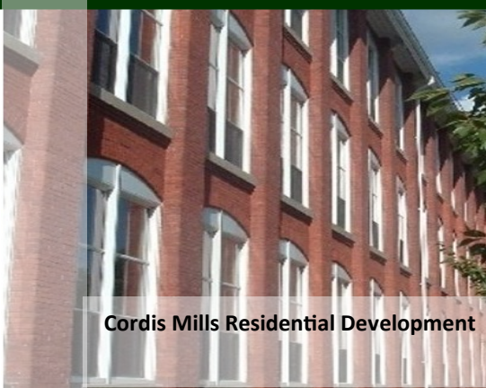
Cordis Mills Residential Development

Located in the Blackstone River Valley National Heritage Corridor, Millbury and Sutton Mass. are part of the Worcester -Metro Area- home to 799,000 people. Millbury is on the forefront of development, resulting from multi-million dollar highway connections and improvements. The Shoppes at Blackstone Valley provide over 750,000 SF for shopping and dining. A picturesque, bedroom community, Sutton hosts firms such as Atlas Box, CARQUEST, Polyvinyl, and others.