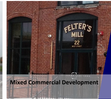
Mixed Commercial Development