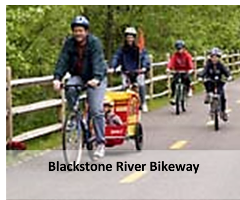
Blackstone River Bikeway