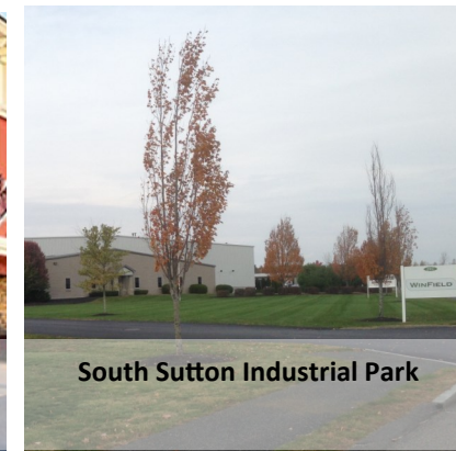
South Sutton Industrial Park