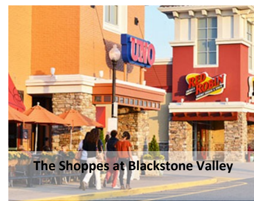
The Shoppes at Blackstone Valley