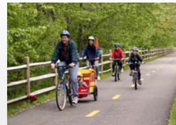
Blackstone River Bikeway

Millbury is well named, as the Blackstone River, Singletary Brook and other waterways powered mills making guns, lumber, paper, textiles and many other products.