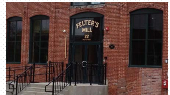
Felter's Mill—mixed commercial development

Blackstone River Valley National Heritage Corridor