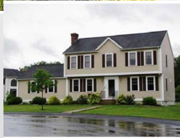
Cronin Brook Heights

Several sites were identified as Regional Priority Development Areas in the 2012 Blackstone Valley Prioritization Project