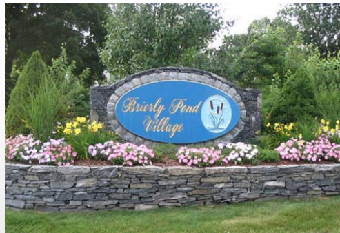
Brierly Pond Village—an over 55 community