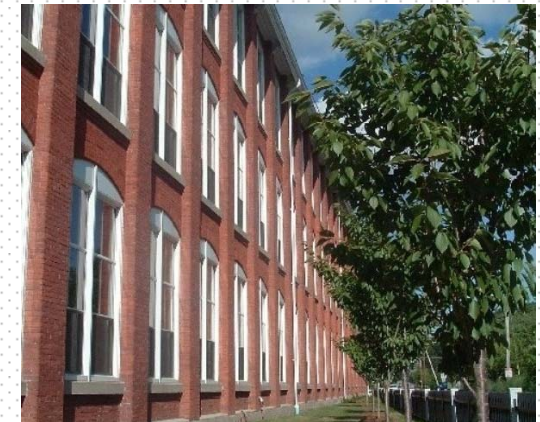
Cordis Mills—residential development

Millbury is a Preserve America community— Celebrating its bicentennial in 2013!