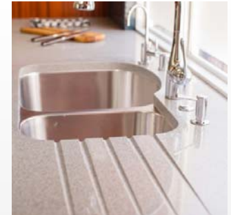
Discover Marble and Granite in the Latti Farm Industrial park