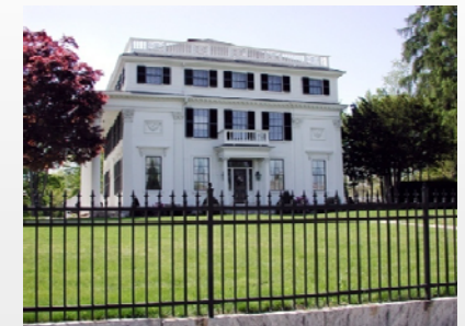
Asa Waters Mansion

Please contact Laurie Connors, Town Planner: lconnors@townofmillbury.net or 508.865.4754